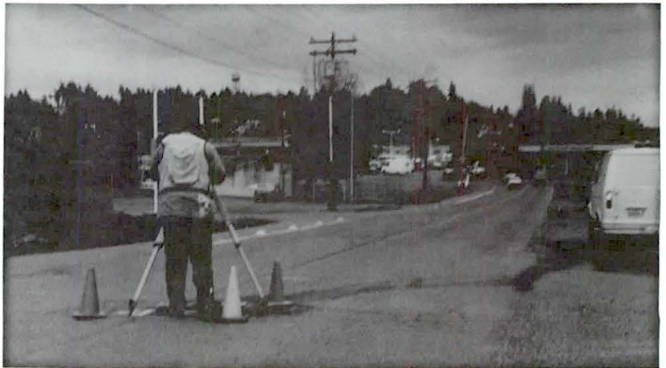
A surveyor works on 7th Avenue South, Phase 1 of the downtown roads project.

City crews will be picking up debris along roadways April 13-21, which has been designated Spring Cleanup Week.