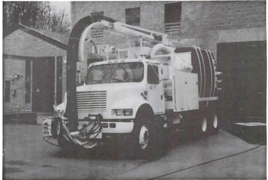
A "flush truck" has been purchased to clean catch basins and storm drain lines.

He was chosen in the city's employee-recognition program because he best exhibits City Hall's "Sails with Pride" employee values of "Positive, Resourceful, Integrity, Dedication and Excellence."